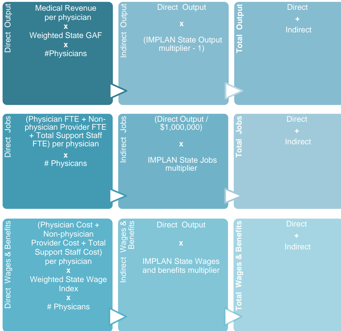
Figure 2. Overview of Methods